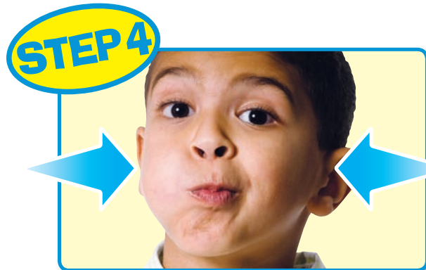
Rinse well two or three times.