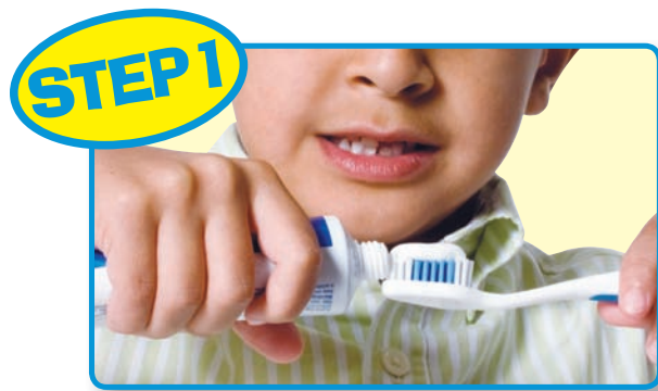
Put toothpaste on brush.