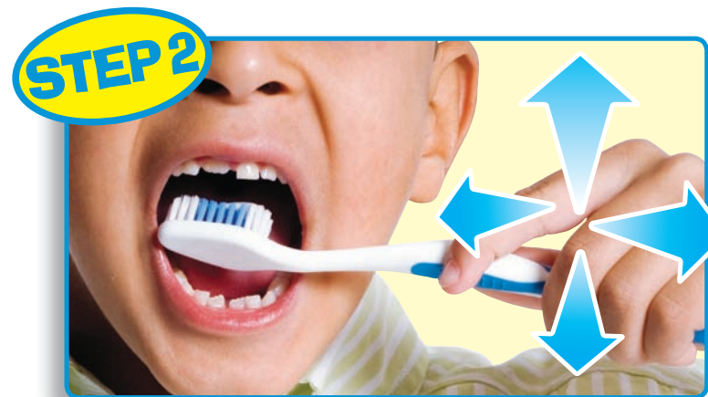
Gently brush teeth on all sides, gums, and tongue. Rinse.