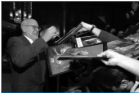
Frank Oz (voice of Yoda) signs autographs for Star Wars fans

In addition to the NYC debut, Star Wars: Episode III Revenge of the Sith charity premieres took place on May 12th in Seattle, Los Angeles, Chicago, Washington D.C., Boston, Denver, Atlanta, San Francisco, and Miami.