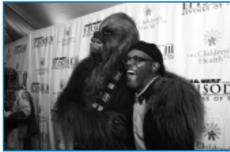
Samuel L. Jackson has a laugh with Chewbacca on the red carpet

On May 12, 2005, The Children's Health Fund benefited from the official New York City red carpet premiere and after-party of the much-anticipated Star Wars: Episode III Revenge of The Sith . This partnership with CHF upheld George Lucas' tradition of utilizing the widespread enthusiasm for the Star Wars film series to help raise critical funds and awareness for issues affecting children and families. All