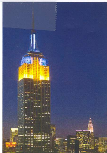
The Empire State Building was illuminated blue and yellow in recognition of the Children's Health Fund's annual gala dinner